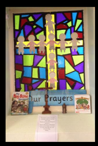
to if they have a problem or just need a friend."

"We also love our special jumpers which help children identify us as someone they can go