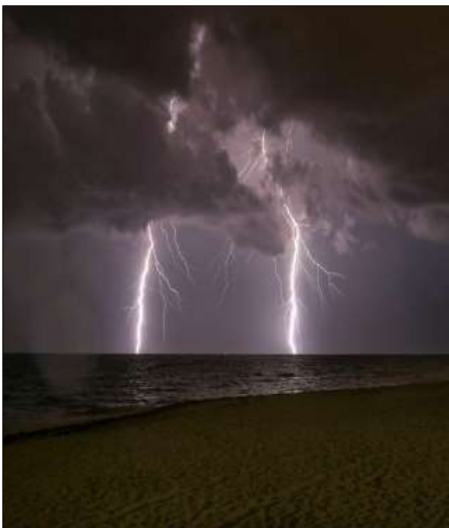
Pictured: A typical photo of lightening during a storm.

After the public made their suggestions, the Met Office and Met Éireann have confirmed the names of upcoming storms for 2019/20 as Atiyah, Brendan, Ciara, Dennis, Ellen, Francis, Gerda, Hugh, Iris, Jan, Kitty, Liam, Maura, Noah, Olivia, Piet, Roisin, Samir, Tara, Vince and Willow. The Name our Storms campaign aims to raise awareness of the impact of severe weather before it hits. This is the fifth year that it has run and the first year that the Royal Netherlands Meteorological Institute (KNMI), the Dutch national weather forecasting service, has been involved. The season's names have been compiled from a list of submissions by the public, choosing some of the most popular names and also selecting those which reflect the diversity of the three nations. The alphabetical list of names skips Q, U, X, Y and Z to comply with international storm-naming conventions.