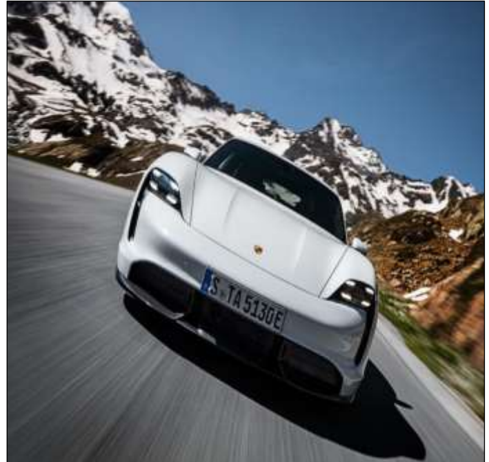
Pictured: The Porsche Taycan Turbo S taken from the Porsche GB Twitter page.

The Taycan (pronounced tie-can) is the first zero-emissions all-electric sports car from Porsche. It is also the first production vehicle with a system voltage of 800 volts rather than the normal 400 volts for electric cars. This delivers continuous high power and charging capacities to enable both fast driving and fast loading, while also reducing the weight of the high-voltage cabling, meaning the car can accelerate up to 62mph in 2.8 seconds, have a top speed of 161mph and a range of up to 257 miles. Company chairman, Oliver Blume, said the Taycan 'marks the start of a new era' for Porsche. UK customers should expect to see models arriving in January next year.