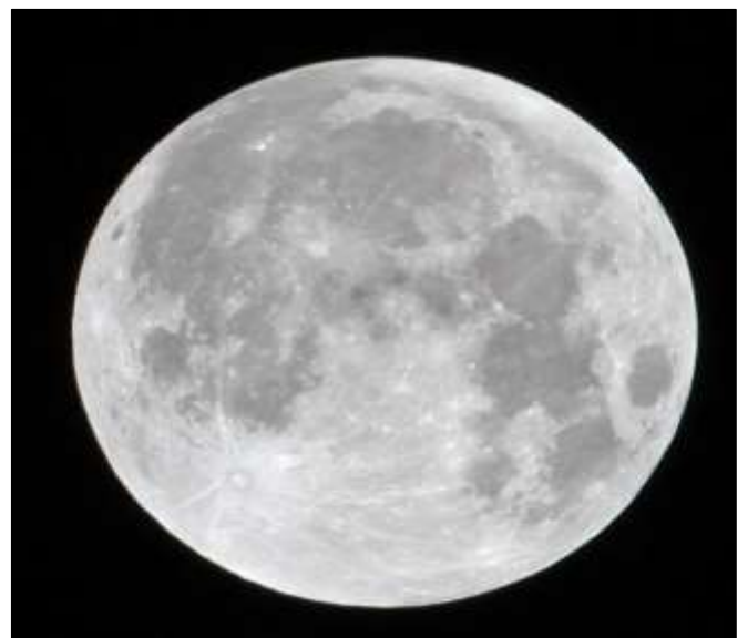
Pictured: A typical image of the Moon.

China's space agency previously said the current mission 'lifted the mysterious veil' from the far side of the moon, which is never seen from Earth, and 'opened a new chapter in human lunar exploration'.